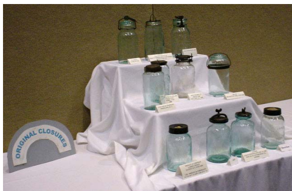
Perhaps no aspect of fruit jars exhibits more creativity and variety than the early closures. Norman Barnett displayed some of the most unusual ones.