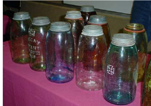
A sampling of the colorful Mason's Patent Nov. 30 TH 1858 jars with Hero Cross symbol that were brought to show and tell.

The next club meeting will be Feb. 4th at Minnetrista in the Cantina Room!