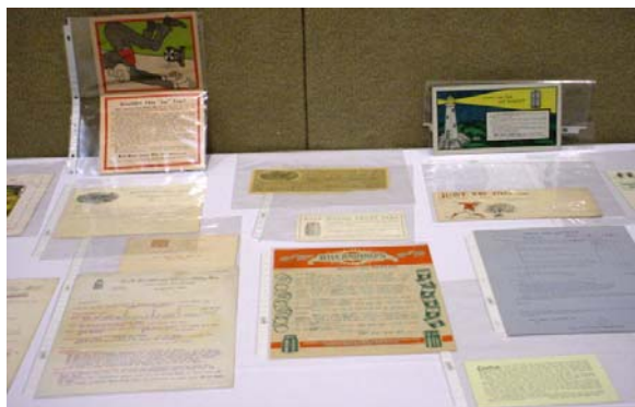
Dick Cole displayed many well-preserved pieces of early Ball literature.