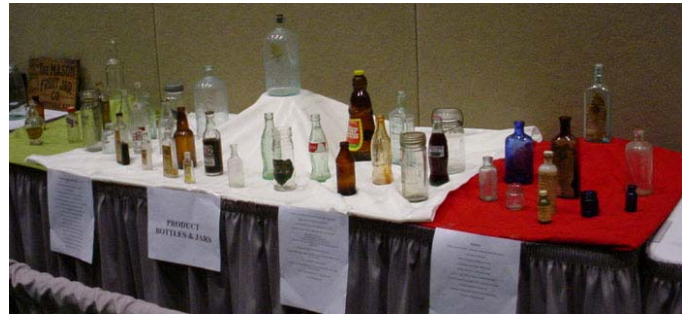
Colleen Dixon showed a nice group of product jars and bottles for household use, foods and medicines.