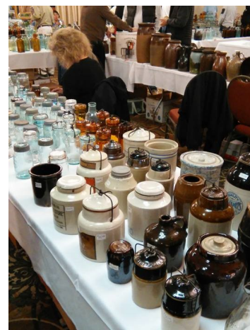
The Phifers' sales table