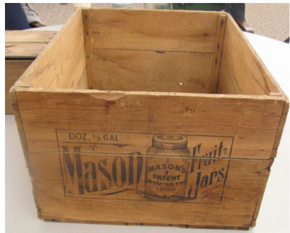
Wooden shipping box for a dozen half gallon Mason fruit jars (jar design on the box: Mason's Patent Nov. 30 th 1858)