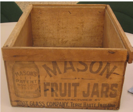
Wooden shipping box for one dozen quart Mason fruit jars from the Root Glass Company