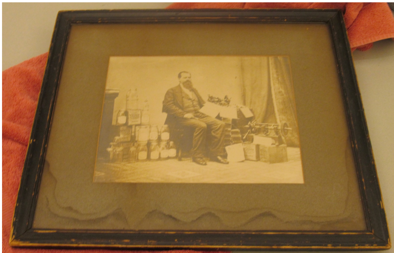
Sepia toned photograph of John Landis Mason, circa 1872, showing him sitting amongst boxes of fruit jars and trimmings