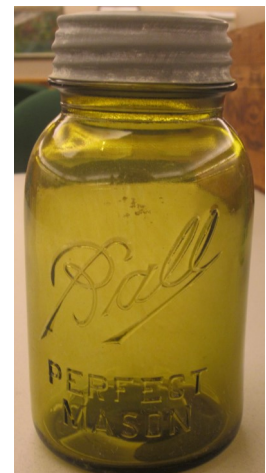
Olive green QT Ball Perfect Mason