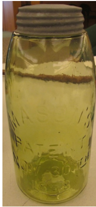
Olive yellow HG Mason's Patent Nov. 30 th 1858