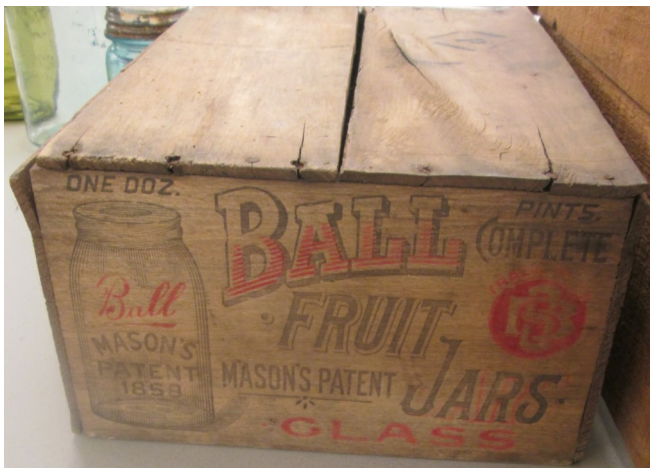
Wooden shipping box for a dozen pint Ball fruit jars (jar design on the box: Ball Mason's Patent 1858)