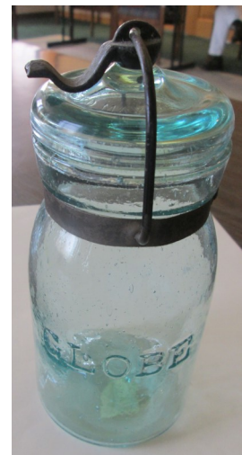
An aqua PT Globe