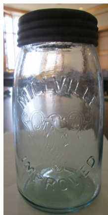
Aqua QT Millville WTCO Improved with correct glass top seal lid