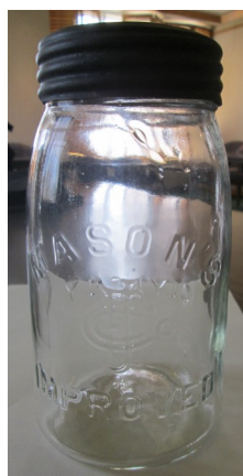
Clear QT Mason's Patent CFJCo Improved (reverse: Clyde, N.Y.) with correct glass top seal lid