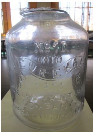
A rare clear 96 oz. N o 10 jar from The Ohio Fruit Jar Company