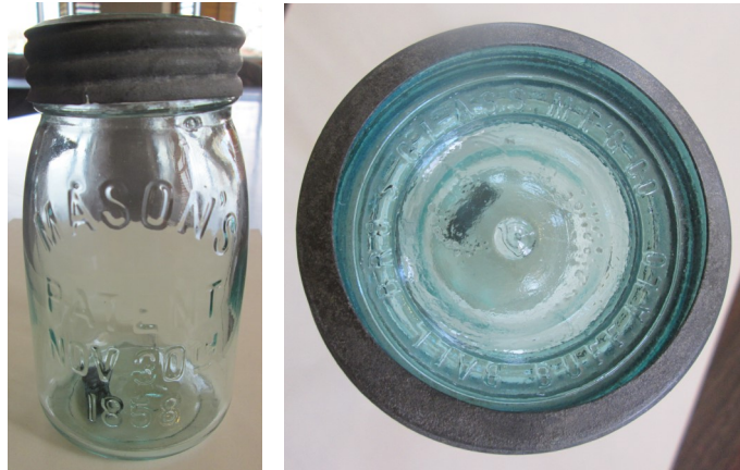
An aqua midget PT Mason's Patent Nov 30 th 1858 with Ball Bros. Glass Mfg. Co., Buffalo, N.Y. glass top seal lid