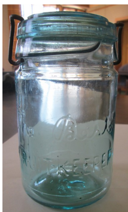
Aqua PT The Best Fruit-Keeper