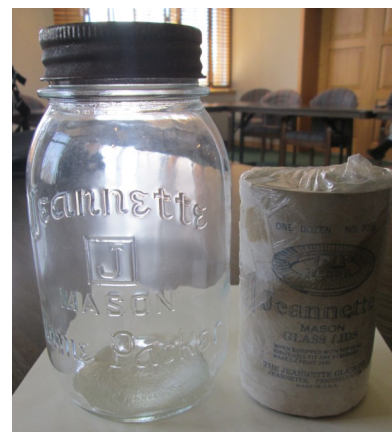
Clear QT Jeannette (J in square) Mason Home Packer with correct glass top seal lid; and an original cardboard carton of Jeannette lids