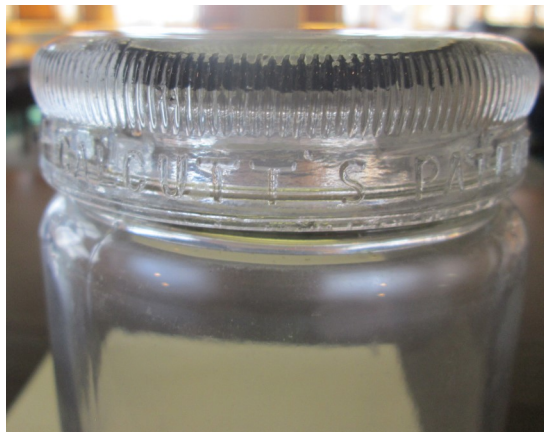
Clear QT Calcutt's Patent Apr. 11th Nov. 7th 1893 (around glass screw cap)