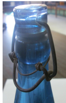
Dark blue Millville bottle with glass stopper