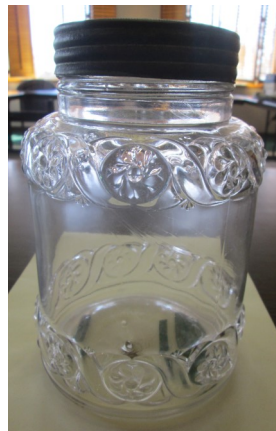
A clear QT fancy design jar with correct clear glass top seal lid embossed with an eagle