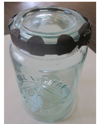
An aqua PT The Victor 1899 with glass top seal lid and complete clamp