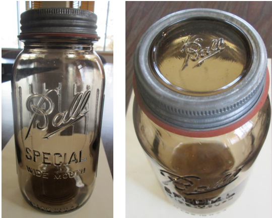
An "irradiated" smokey HG Ball Special Wide Mouth Made In U.S.A. with Ball glass top seal lid