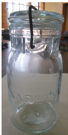
Aqua PT Safety