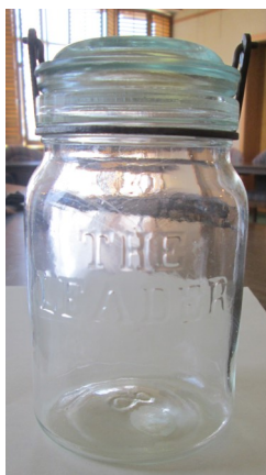
Aqua PT The Leader (two lines)