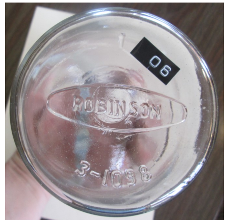
A clear PT and QT "Robinson" jar with correct glass top seal lid and metal clip (embossed with an Arrow and Robinson); sides of jar are unembossed, and base is embossed Robinson in an oval