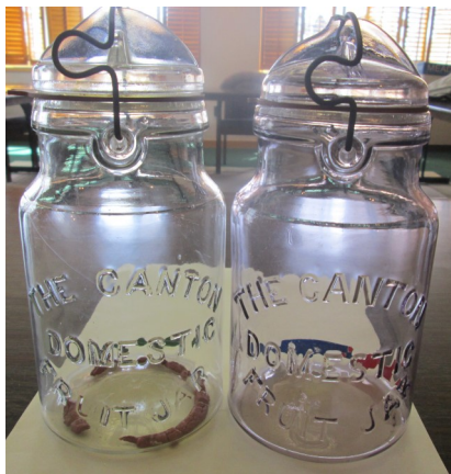
Clear and SCA QT The Canton Domestic Fruit Jar with two different correct glass lids (flat and domed)